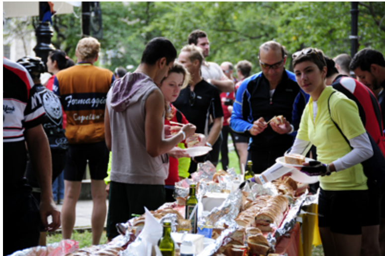
Great Escape! After the ride in Sakura Park.

The after-party, which took place in Sakura Park with 6-foot long Manganaro's Heroboy sandwiches, free gelato from Gelato Giuliana, Zico coconut water, plus other tasty treats proved to be as much fun as the ride itself.