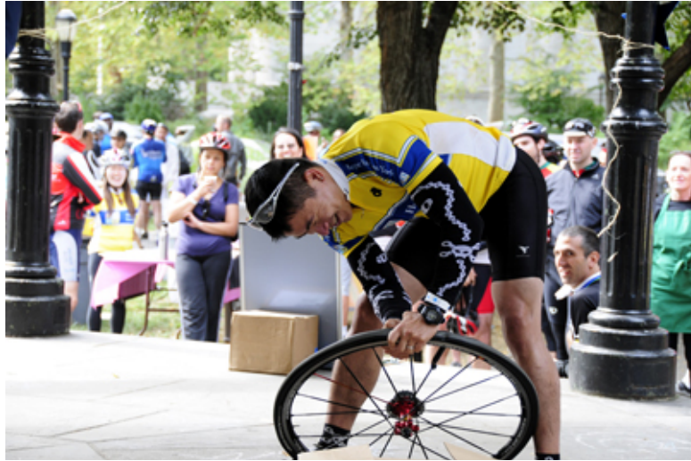
After the ride - flat fixing competition.