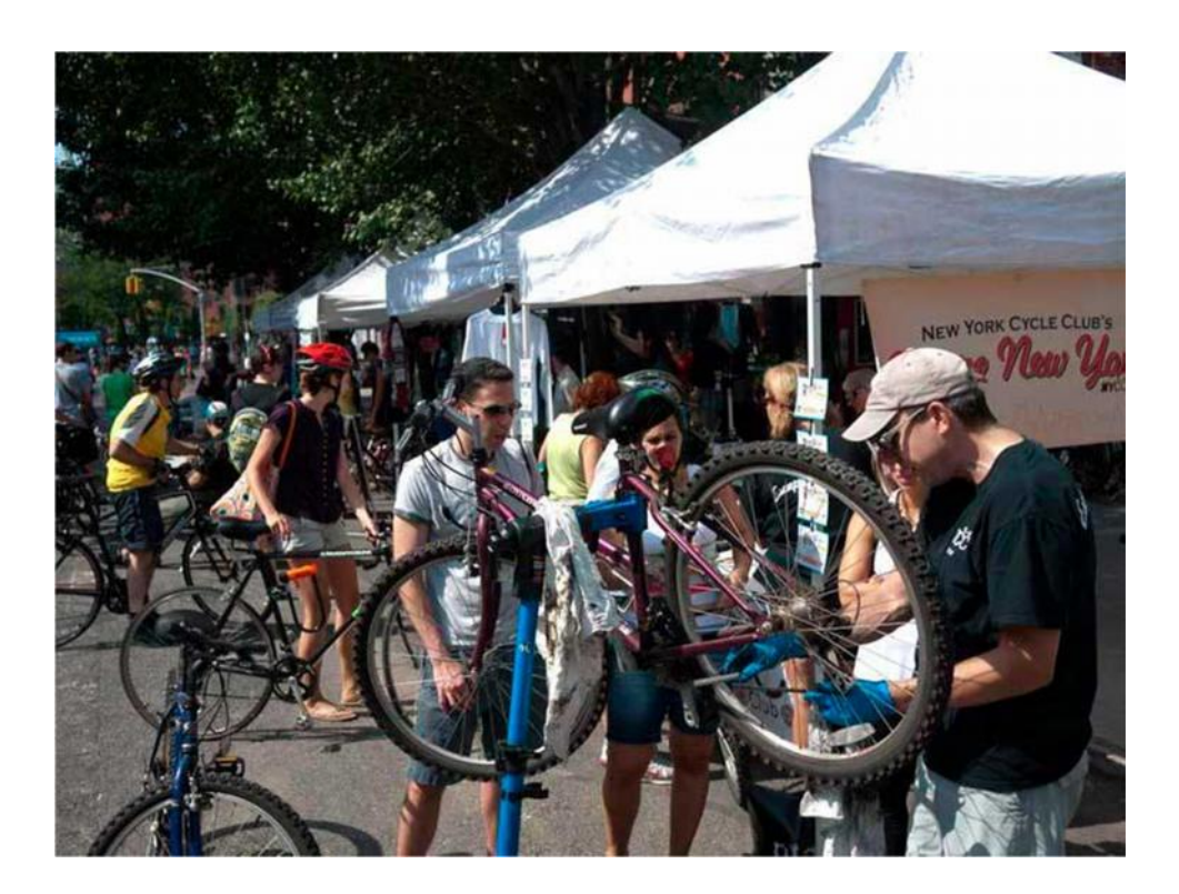
2011 Summer Streets

Honestly folks, you can't have more fun than being part of this street party and pitching the Club. I recommend you try it next year.