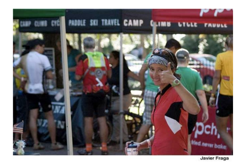
And, of course, there's the Escape New York Raffle where the grand prize winner will receive an amazing <u>VBT Bicycling Vacations "Tour of Tuscany"</u>!

NYC Water is the official water of Escape New York! Naturally!