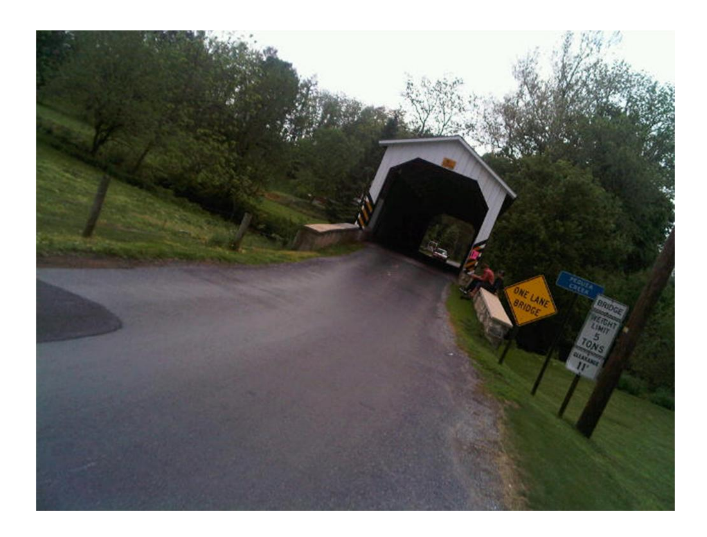
Day 3 Valley Forge to Camp Andrews, Holtwood, PA 68 miles

When studying the route before starting the ride I had deemed Day 3 the 'difficult day,' and it was. It was hilly, long, and followed two days of riding...our hump day. It was a gorgeous route through Amish country though...sprawling farms, horses, cows, goats, horse-drawn carriages, covered bridges, other cyclists, cheering Amish children who wanted to know if we were tired (Yes!), and myriad other things. The morning was misty, with a soft rain falling. It was beautiful and it was slippery. There were also something like 24 flat tires, including on one of the support vans. I was spared a flat, but had to have a pedal looked at after lunch. Who knew that clips could jam? So at mile 68, as I pedaled into Camp Andrews to the sound of (crazy) people using the camp's zip line, I felt a real sense of accomplishment...I