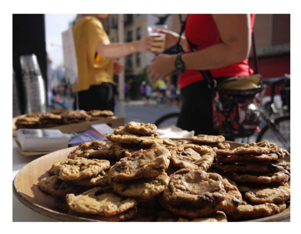
One reason to stop by the NYCC tent at Summer Streets – it's next to free chocolate chip cookies & lemonade from Escape New York supporter City Bakery!