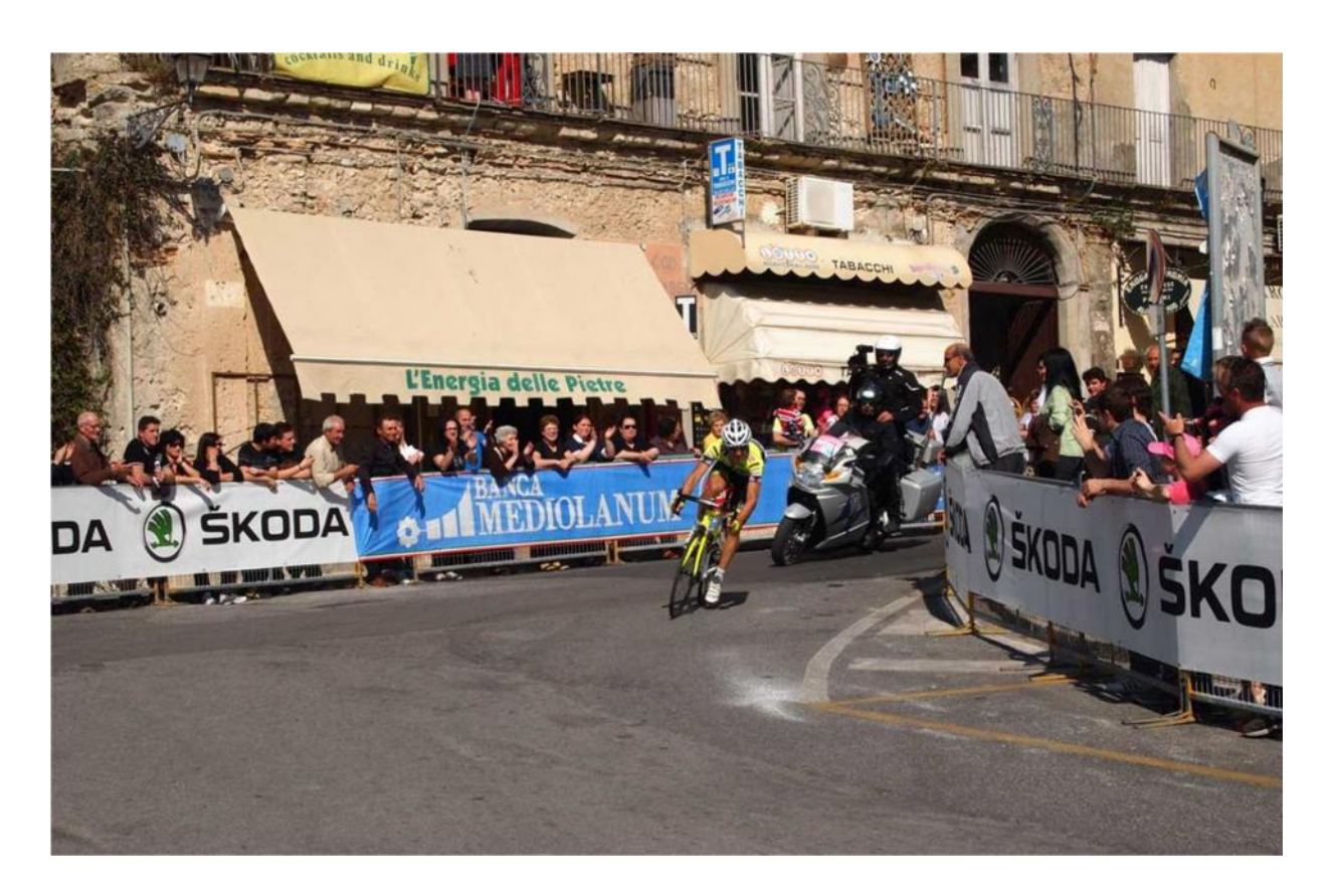
Tropea, lead racer comes around final turn 1,100 metres from finish

Calabria proved to be much the same... the coast road is <u>not</u> flat! But we had a rest day in Tropea that coincided with the end of a stage of the Giro. We watched as the town prepared, picked up our swag at the publicity area and claimed our spots close to the finish. The atmosphere was exciting, but a breakaway rider stole the stage from the sprinters, making the finish not quite as exciting as it might have been.