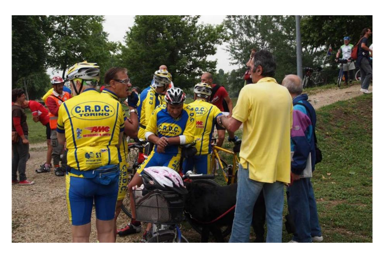
Members of the cycle club of retired public employees in Turin

We bicycle-paraded into downtown with a police escort to a warehouse complex that now houses an exhibit celebrating the 150th Anniversay of the Unification. After a press conference and photos (yes, there was an article in the next day's paper), we were treated to a light lunch. Our tour would end after a celebratory dinner that evening. Everyone had made it in good health and good spirits. (The bikes were in slightly worse shape – at least six broken spokes and a dropped left crank arm, not to mention shifting problems, flats, stubborn tires and miscellaneous other minor inconveniences.)