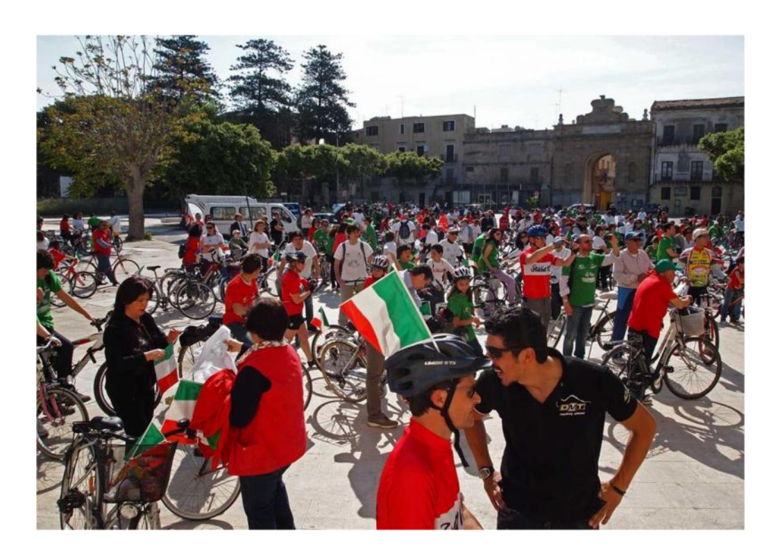
National Bike Day, Marsala