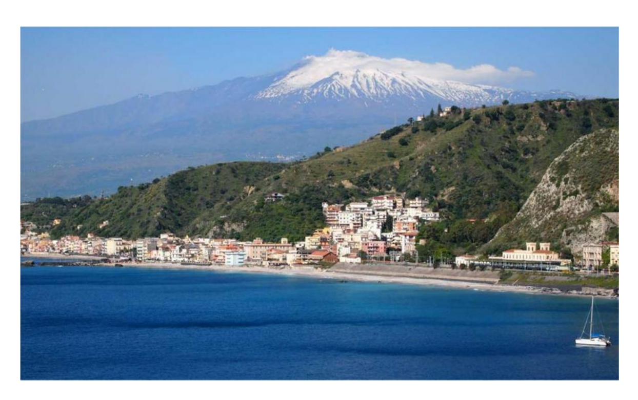
Mt. Etna over Giardini Naxos, eastern Sicily

Sicily was rugged and beautiful, with occasional Greek and Roman ruins and the imposing Mt. Etna presiding over the eastern half of the island.