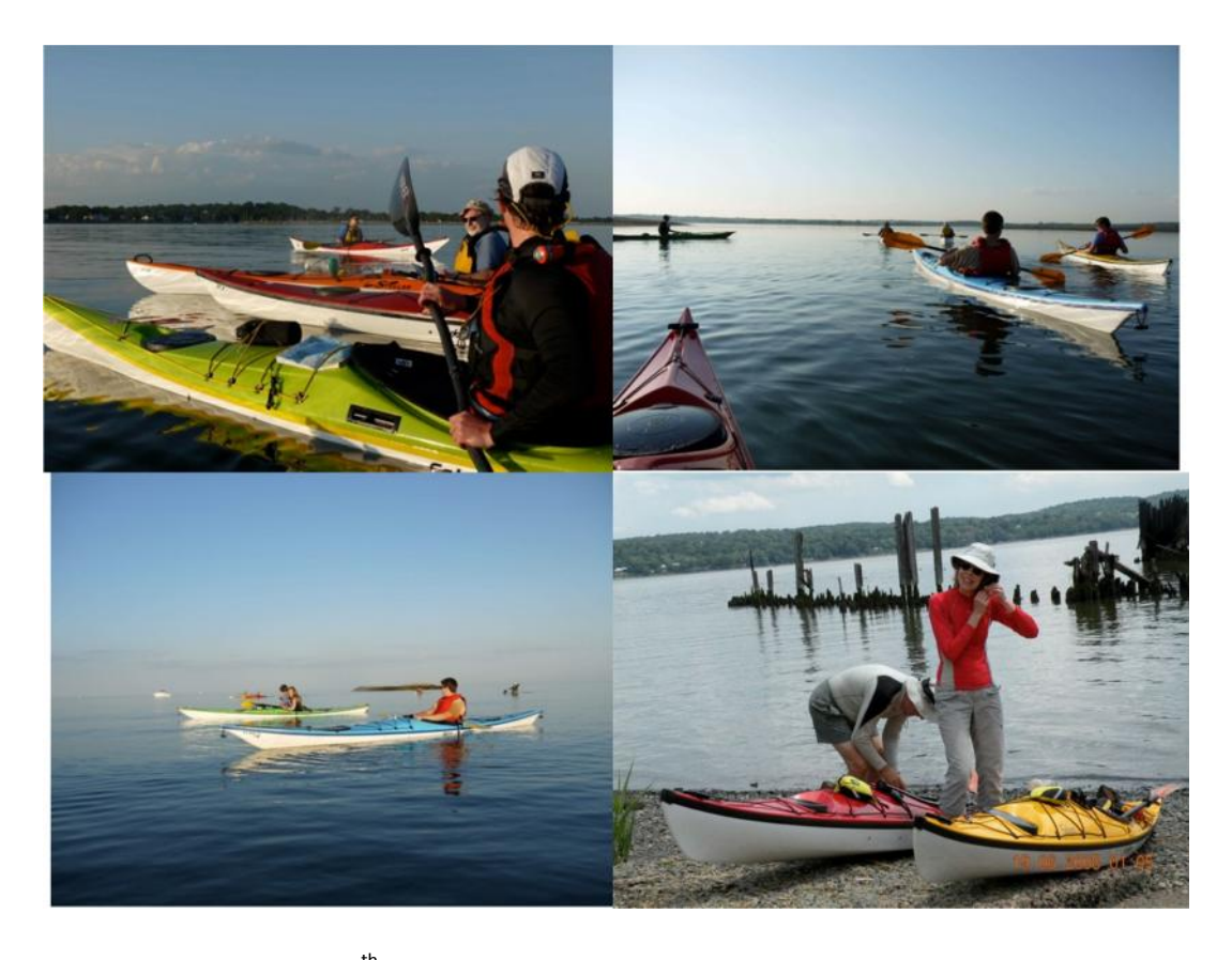
August 28: Social Sunday -- Pedal and Paddle

Where : Knish Nosh Café at the Central Park Sailboat Pond adjacent to the Model Boat House, 73<sup>rd</sup> Street and Fifth Avenue. Knish Nosh Café is located immediately down the hill upon entering the park at 73rd and Fifth.