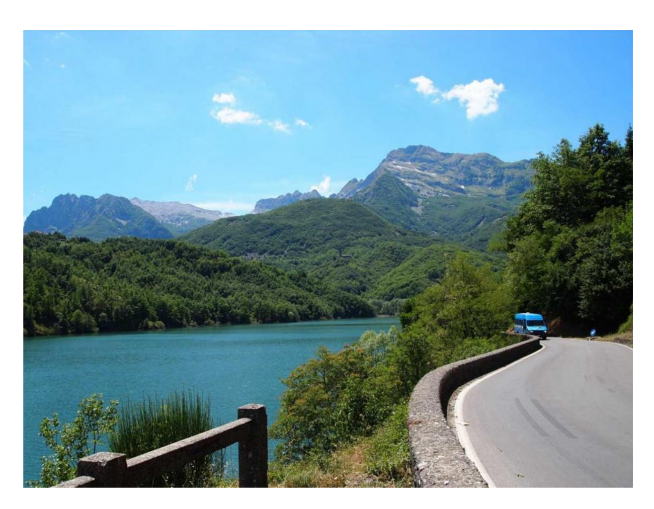
Mountain lake in Tuscany

Then we had the Perfect Day. Perfect weather – clear, dry air, sunny and warm but with cooling breezes and much shade. Smooth roads with gentle climbs and sweet descents. Endlessly beautiful Tuscan scenery with lunch on the shore of a crystal blue lake. And at a total distance of 56 miles, short enough to stop for photos or just look out over the rooftops of a little village from the middle of a climb. Why we ride!!