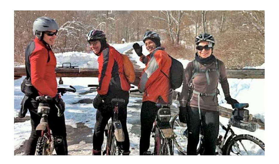
Don't Let Snow and Ice Keep you Down - Join the "Quick Studdies"

Under the ride listings it's "Winter Training and Fun."