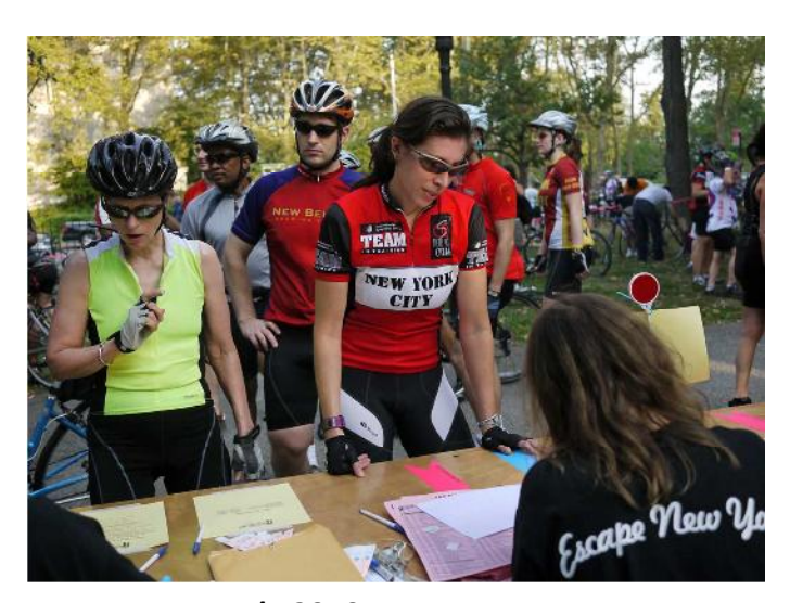
Escape New York, 2010